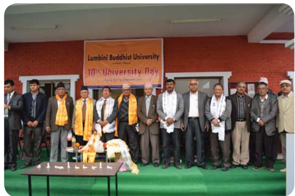
Distinguished guests with LBU Authorities