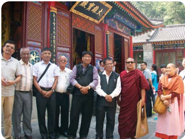
Team of delegates visiting China