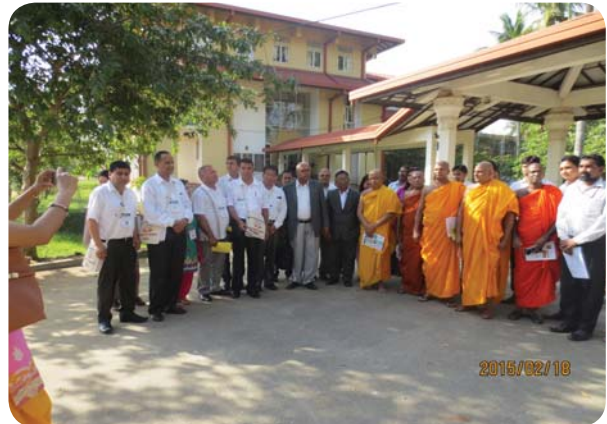
LBU delegates in Sri Lanka

five members of delegates met Hon. Minister of Religious Affairs of Government of Sri Lanka.