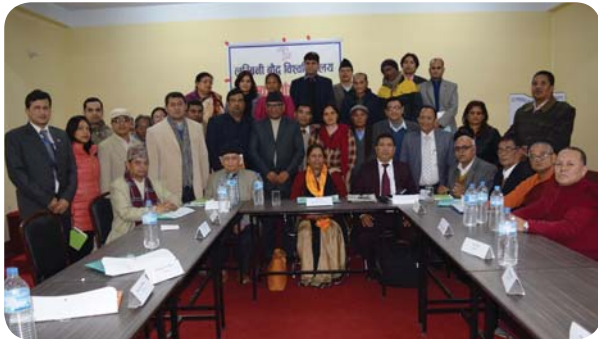
Participants of 5th Senate Meeting, 2071 BS

Lumbini Buddhist University conducted the 5 th University Senate Meeting on 18 th Poush 2071 at LBU Central Office, Lumbini. The meeting was presided by the Pro-Chancellor Hon. Mrs Chitralekha Yadav, the then Minister of Education, Government of Nepal.