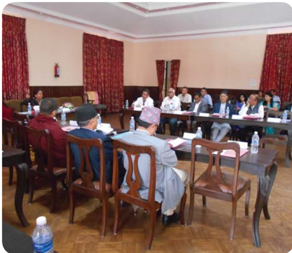
Glimpse of 6th Senate Meeting

Similarly, LBU conducted the 6 th University Senate Meeting in the Meeting Hall at Prime Minister's Resident, Baluwar. The meeting was presided by the Pro-Chancellor Hon. Mrs Chitralekha Yadav, the then Minister of Education, Government of Nepal