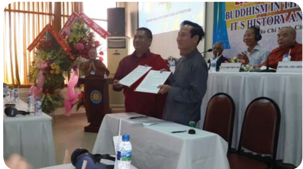
MOU between LBU and VBU

a Memorandum of Understanding was signed between Lumbini Buddhist University and Vietnam Buddhist University on 13th November 2015 at the conference venue.