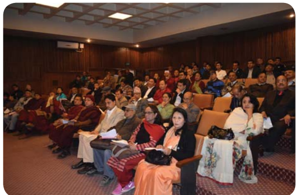
Participants at an interaction programme of LBU Master Plan held in Kathmandu

Considering teaching and research as two vital components, the Master Plan Draft Committee set a high priority to develop a Draft Academic Master Plan with academic goals and strategic objectives so as to pave the way for achieving academic excellence. In due course of preparation of the Draft Academic Master Plan, Master Plan Draft Committee carried out a series of activities such as i) General internet survey of the Buddhist and other Universities and Institutions offering Buddhist Studies, ii) Interaction programmes with Buddhist Masters, Scholars, Academicians, and Stakeholders, iii) Focus-group meetings with stakeholders, academicians, subject experts from home and abroad seeking their opinions, suggestions and/or comments on different aspects of LBU's proposed Academic Master Plan.