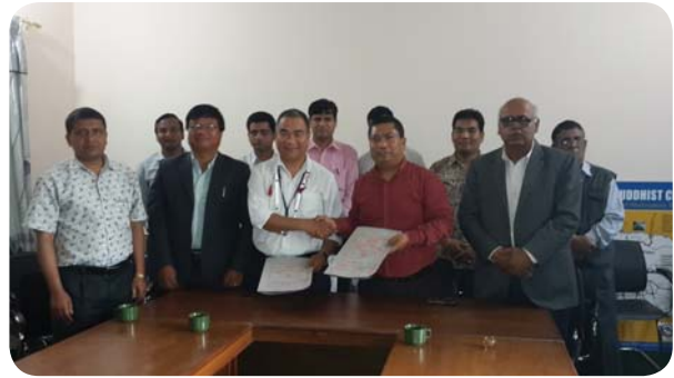
Lease agreement between LDT and LBU regarding land use