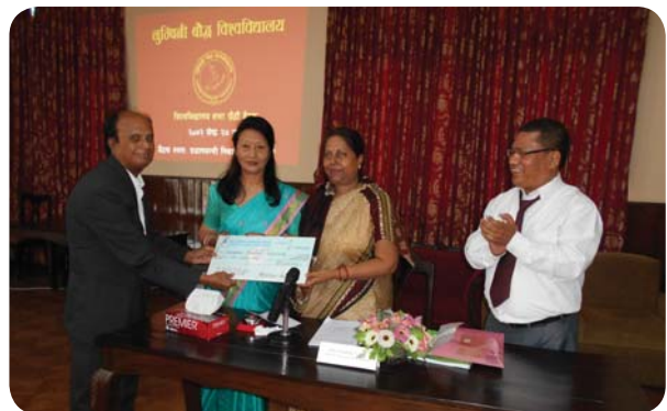
The Cheque of Rs. 500,000 being handed over to LBU