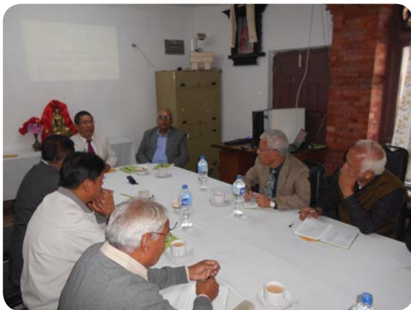
CIA Presentation Meeting at Lotus Research Center