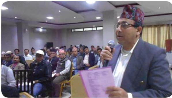
Glimpse of Interaction Programme in Butwal